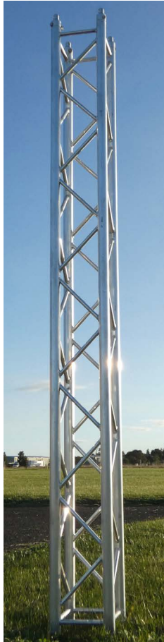
NBS-SAL3 4-sides open lattice section is 3.0 metres overall length per section with incorporated joining sockets and bullets, resulting in an easy alignment and installation.