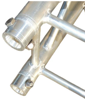
The joining sockets at both ends and and bullets located at one end for ease of installation. Each bullet and joining socket have a nyloc secured bolt for maintaining joint.