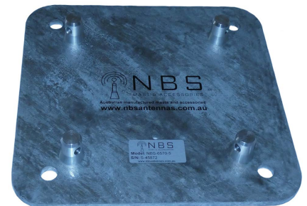
NBS-6570-5 static ground mount plate with alignment bullets requires concrete base with elevated all-thread, NBS-2865/G in-ground base or direct bolt down.